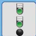
sound & light leakage alarm