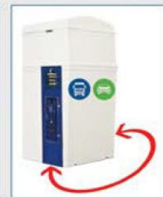
TRUCK & PC (hose reel)

flowrate: 4-40 L/min & 2-10 L/min (Attention! Only SIDED dispenser)