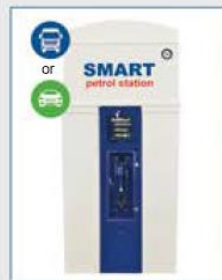
TRUCK or Passenger Car (PC)

All SMART petrol station Units ( FRONT & SIDE DISPENSERS ) can be available in following nozzle versions: