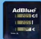
calibrated meter with value display