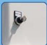
on / off pump key switch