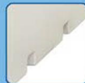
openings for forklift