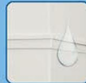
double skin tank (2 tanks)