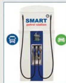
TRUCK & PC (loose hose)

flowrate: 4-40 L/min or flowrate: 2-10 L/min