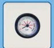
mechanical level indicator