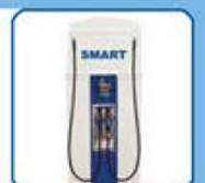
loose hose (comfort version)