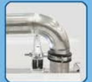
stainless steel construction & piping