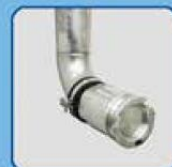
2" dry break coupling for cistern filling