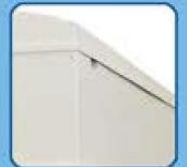
movable roof for maintenance