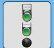
sound & light overflow alarm