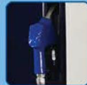
nozzle with automatic shut off & automatic nozzle holder