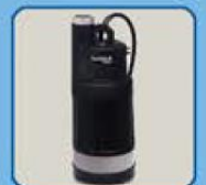
submersible pump with dry run protection