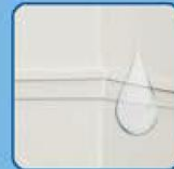
double skin tank (2 tanks)