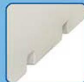
openings for forklift