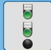
sound & light overfill alarm