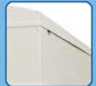
movable roof for maintenance