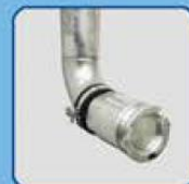
2" dry break coupling for cistern filling