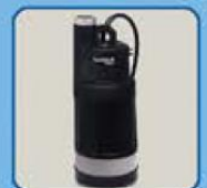
submersible pump with dry run protection