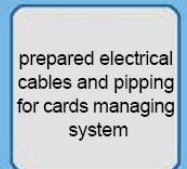
prepared electrical cables and piping for cards managing system