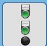
sound & light leakage alarm