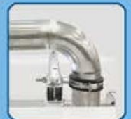
stainless steel construction & piping