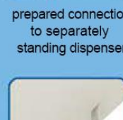
prepared connection to separately standing dispenser