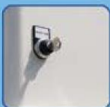
on / off pump key switch