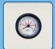
mechanical level indicator