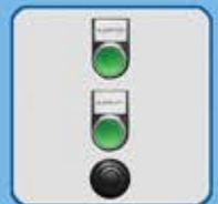
sound & light overfill alarm