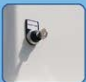
on / off pump key switch