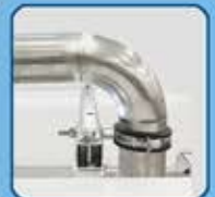
stainless steel construction & piping