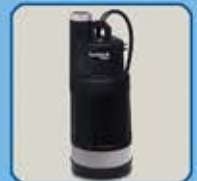
submersible pump with dry run protection