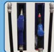
nozzles with automatic shut off & automatic nozzle holders