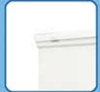
movable roof for maintenance