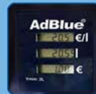
calibrated meter with value display