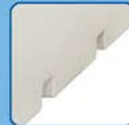
openings for forklift