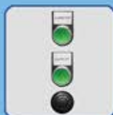
sound & light leakage alarm