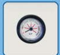
mechanical level indicator