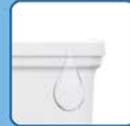
double skin tank (2 tanks)