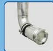
2" dry break coupling for cistern filling